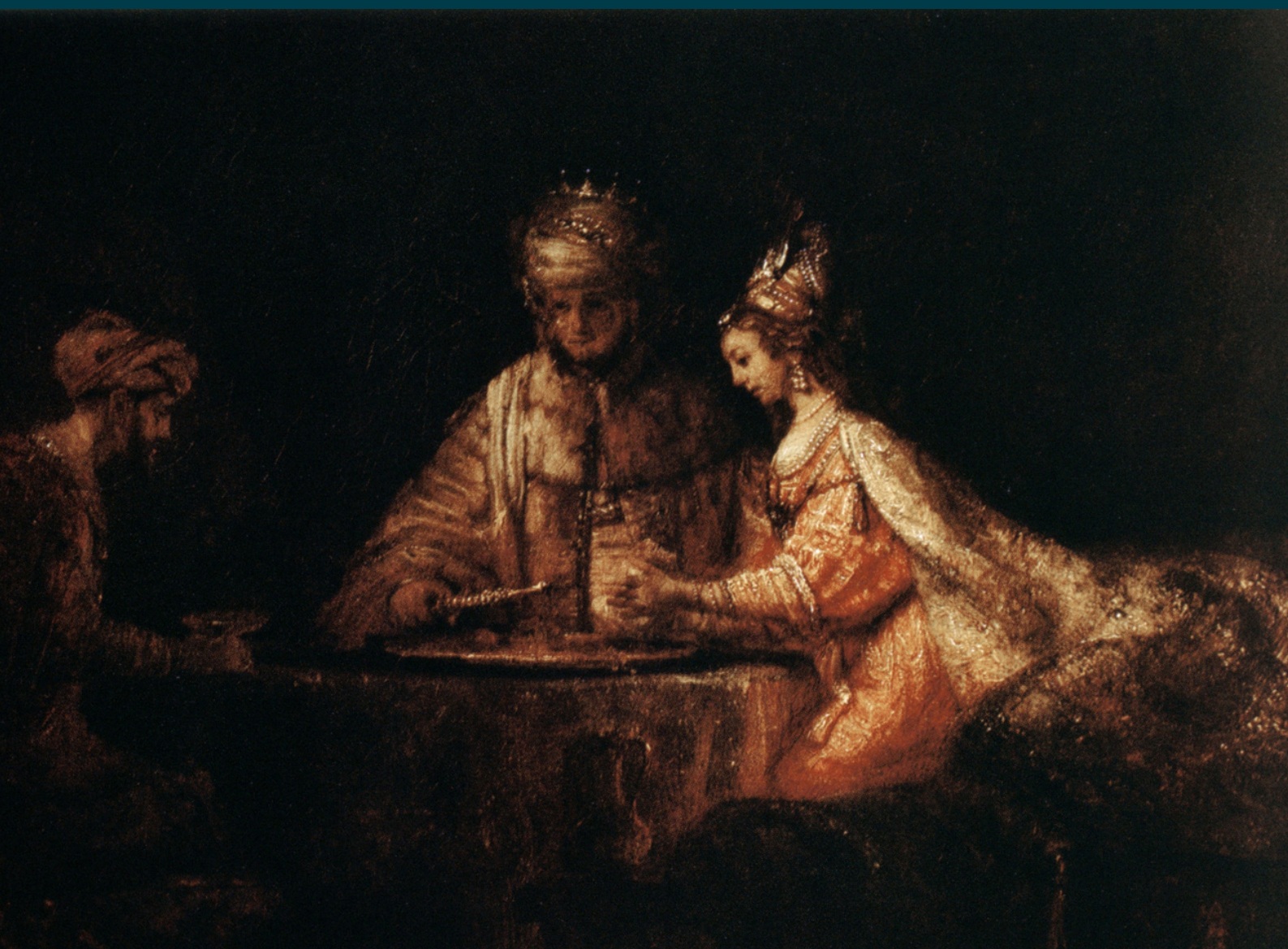
Ahasuerus and Haman at the Feast of Esther by Rembrandt