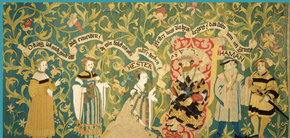
Esther Pleading Before Ahasuerus Tapestry c1540–60, Switzerland