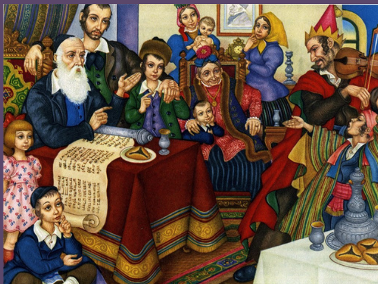
Purim by Arthur Szyk 1948

The festival commemorates the defeat of Haman, the advisor to the Persian king, and his plot to enact a genocide against the Jewish people. The story of Purim is told in the Book of Esther. Esther became the Queen to King Ahasuerus (Xerxes) of Persia, and through her bravery was able to thwart the attempt to slaughter all Jewish people within the Persian empire.