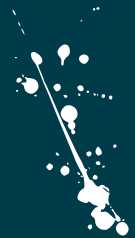
Water to blood

One of the most dramatic moments of the Passover seder comes with the recitation of the 10 plagues that, the Torah says, God brought on the Egyptians to persuade Pharaoh to free the Israelites from slavery.