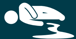
Death of the firstborn