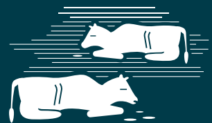
Death of livestock