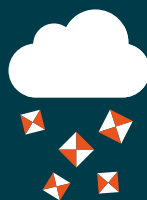
Hail and Fire